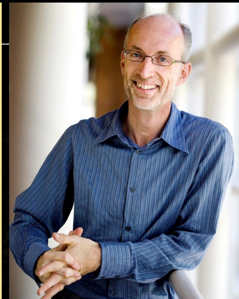
Prof. Dr. Stuart S P Parkin Max Planck Institute for Microstructure Physics, Halle (Saale), Germany

Date: 17 th Nov 2022; 4:00 pm (IST) i.e. 11:30 am (CET)